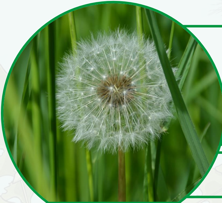
Stage 4 Seed Head

The flower will gradually change into a seed head. This can take up to 15 days to happen.