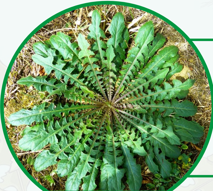
Stage 2 Dandelion Plant

The young dandelion plant will then push up through the ground as it searches for sunlight. The plant will grow stronger as it gets nutrients from the soil. Buds and leaves will begin to grow.