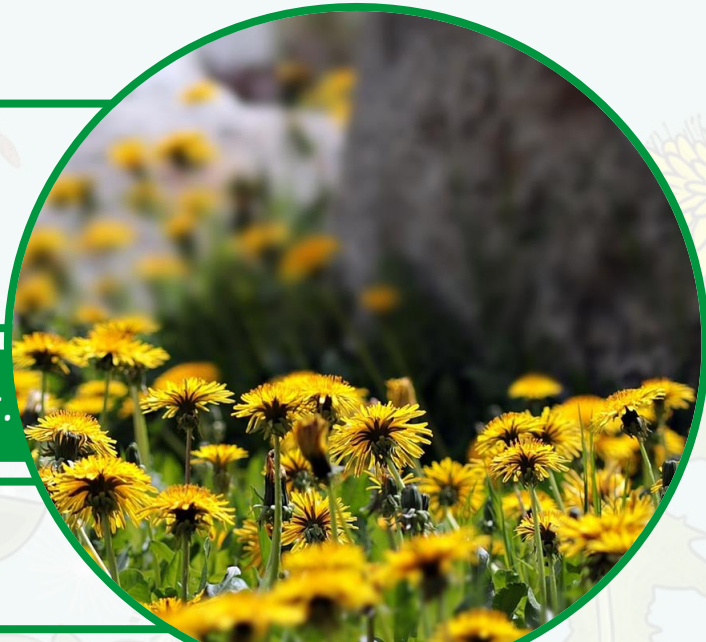
Stage 3 Dandelion Flowers

The flower heads open during the day and close during the night.