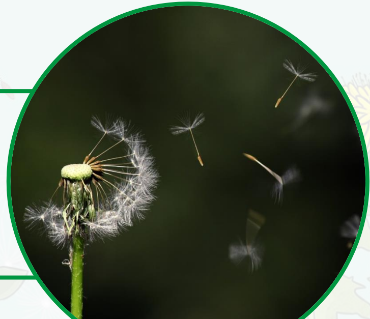
Stage 5 Seed Dispersal

The last stage in the dandelion's life cycle happens when the seeds are blown off and spread by the wind. The new seeds will become dandelion plants if they can find suitable soil to grow in.