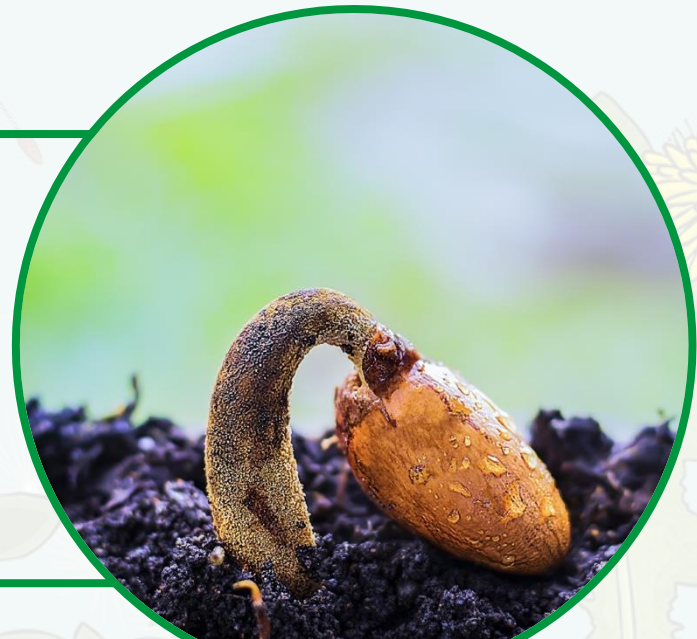
Stage 1 Germination

Each dandelion will begin its life as a seed. Dandelion seeds are spread by the wind. When the conditions are right, the seed will begin to sprout. The roots will push down into the soil and start to grow.